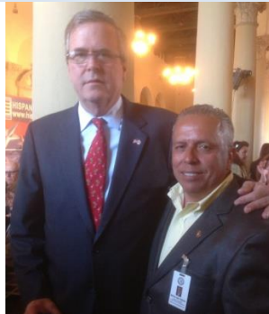
Former U.S. Treasurer Rosario Marin Past Puerto Rico Governor Luis Fortuno