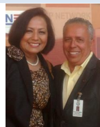
Rosario Marin Former U.S Treasurer