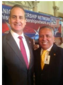
Hon. Mario Diaz-Balart