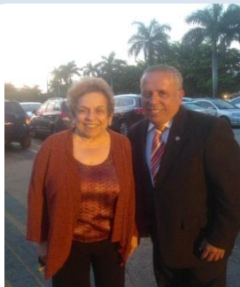
Donna Shalala, President of UM