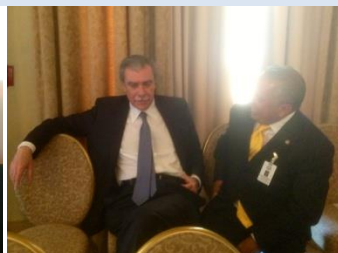
A private conversation U.S Secretary of Commerce